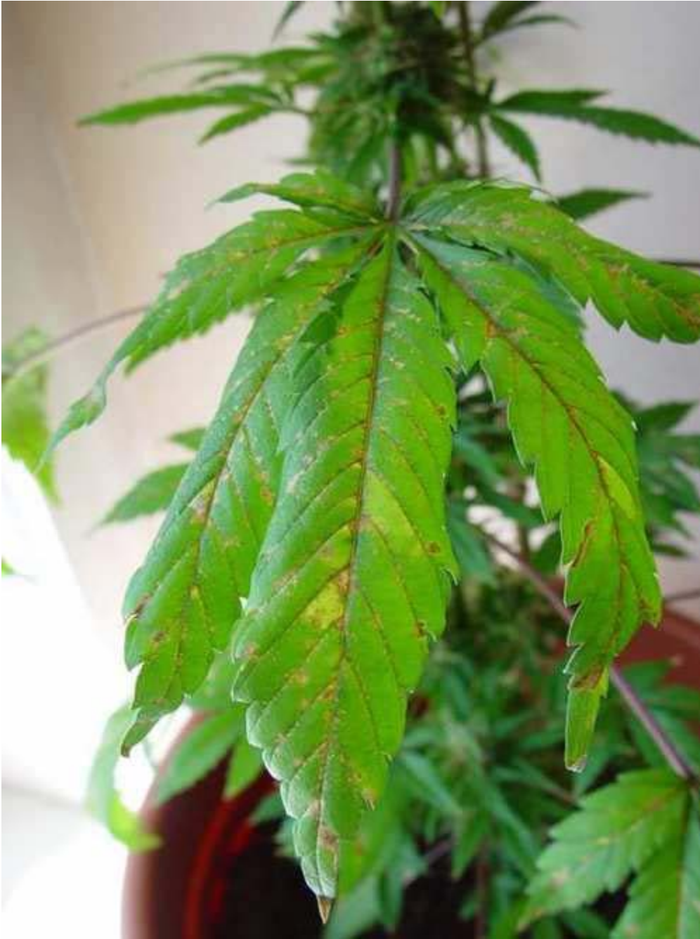
Props goes to Chemical Burn For the Picture!